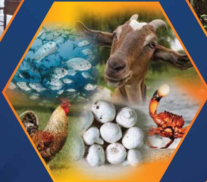
EXPORT OF PROCESSED LIVE STOCKS