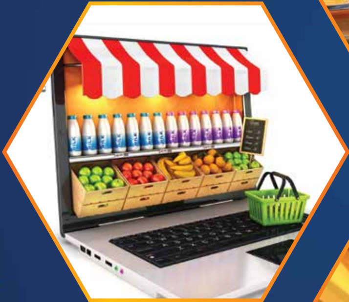
ONLINE GROCERY SHOPPING & SUPERMARKET ( IN INDIA )