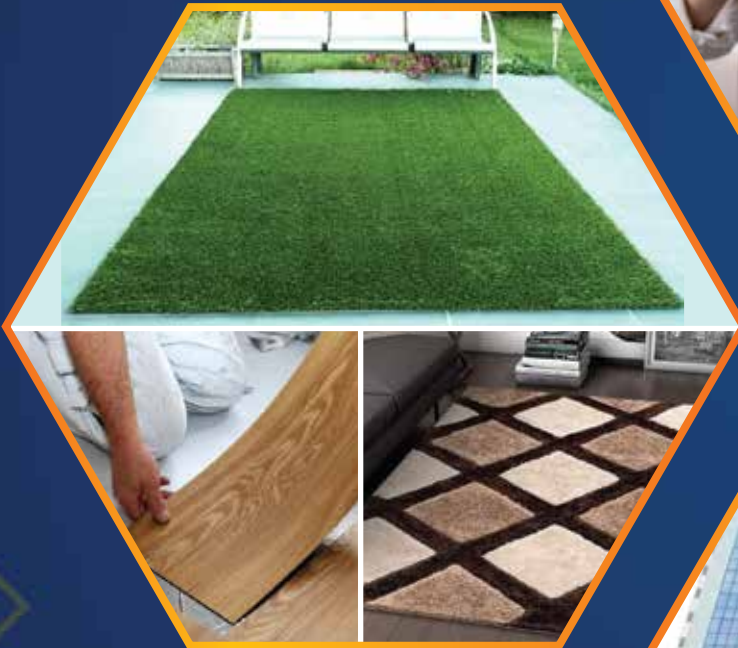
VINYL MAT, FLOOR MAT & GRASS MAT