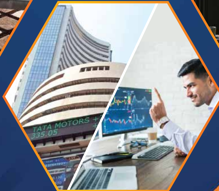
INDIAN & FOREX MARKET