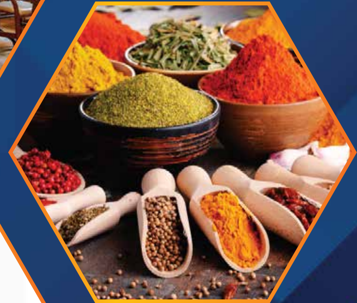
FOOD & SPICES PROCESSING PLANT