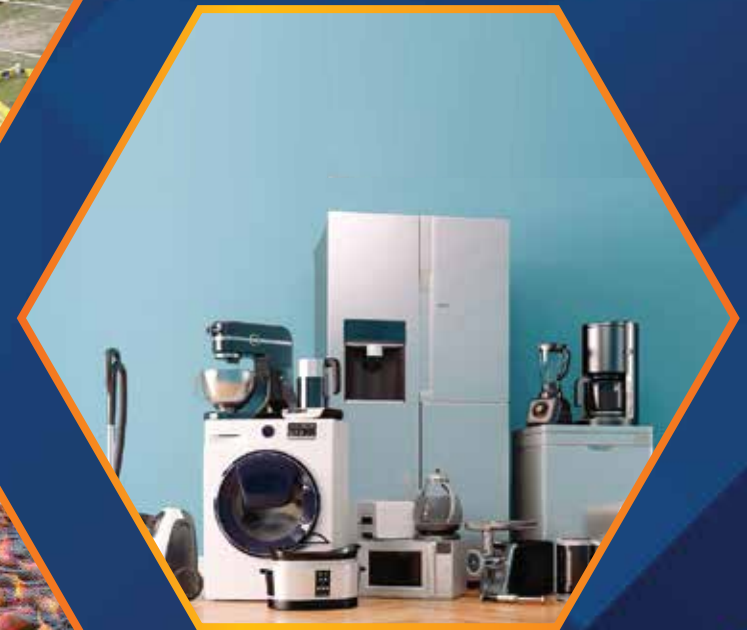
ONLINE HOME APPLIANCES